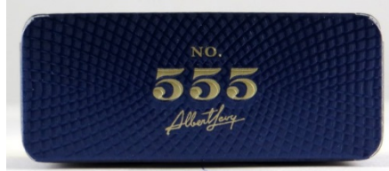
Image 2. Rounded edges