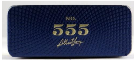
Image 2. Round edges