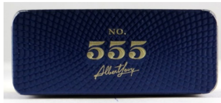
Image 2. Rounded edges