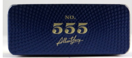
Image 2. Round edges