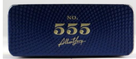
Image 3. Round edges