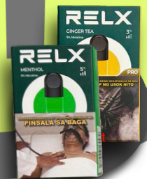
Subjects of discussion Pictured e-cigarette packs were among those viewed by focus group participants.