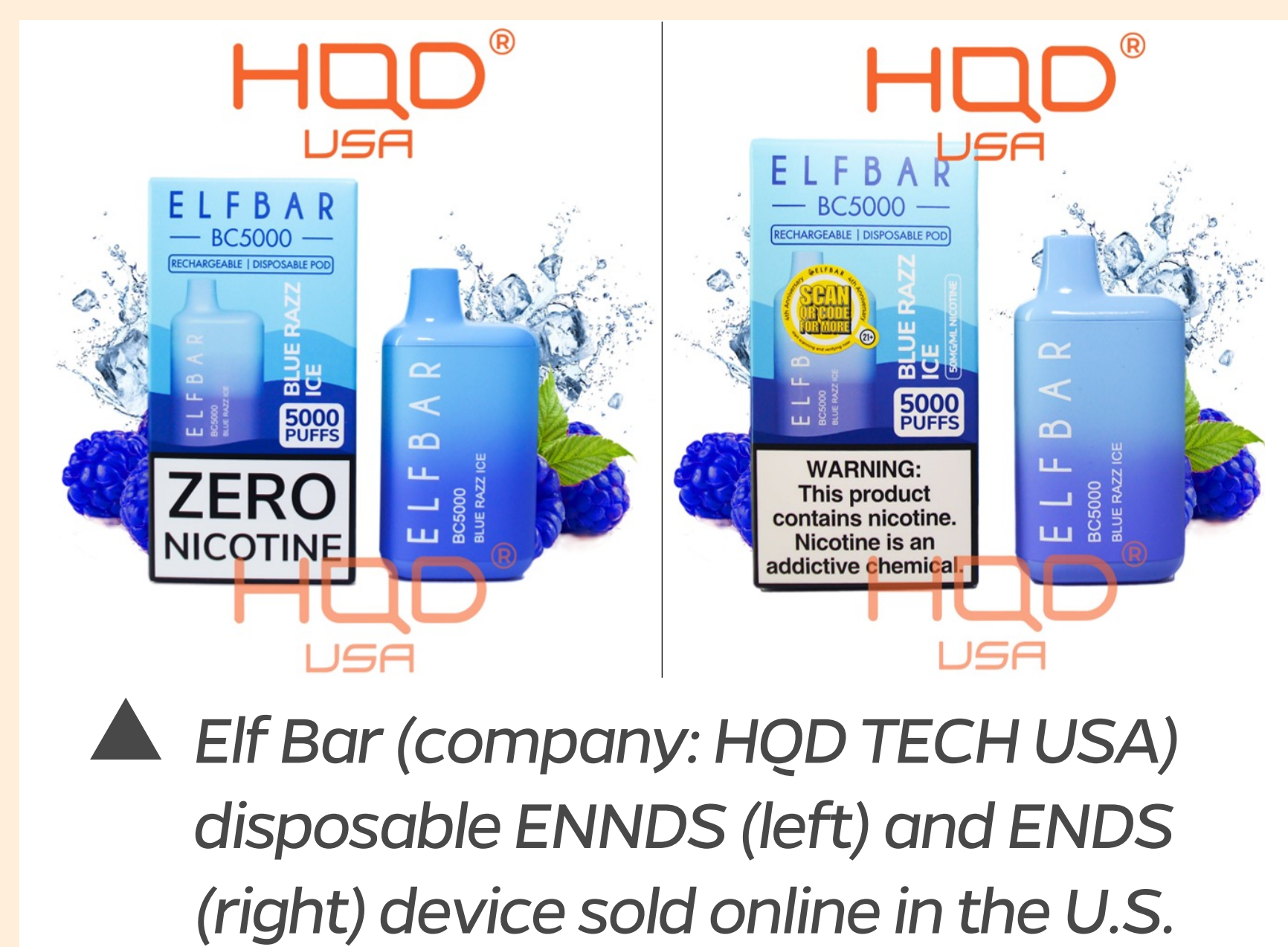
▲ Elf Bar (company: HQD TECH USA) disposable ENNDS (left) and ENDS (right) device sold online in the U.S.

As of Dec 2022, IGTC's E-cigarette Policy Scan identified at least 109 countries or jurisdictions (countries) that regulate e-cigarettes. The scan also surveils countries in this sample that regulate ENNDS. The extent to which countries specifically regulate ENNDS is unclear. Here we report on countries' policies regulating ENNDS.