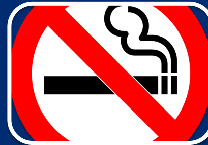
Uso em lugares públicos