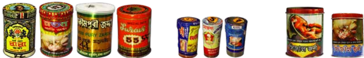
-----Current zordha packs -----| ----Current gul packs----| Standard zordha | Standard gul