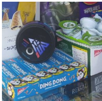
A tobacco vendor in Peshwar city displaying a Velo products.