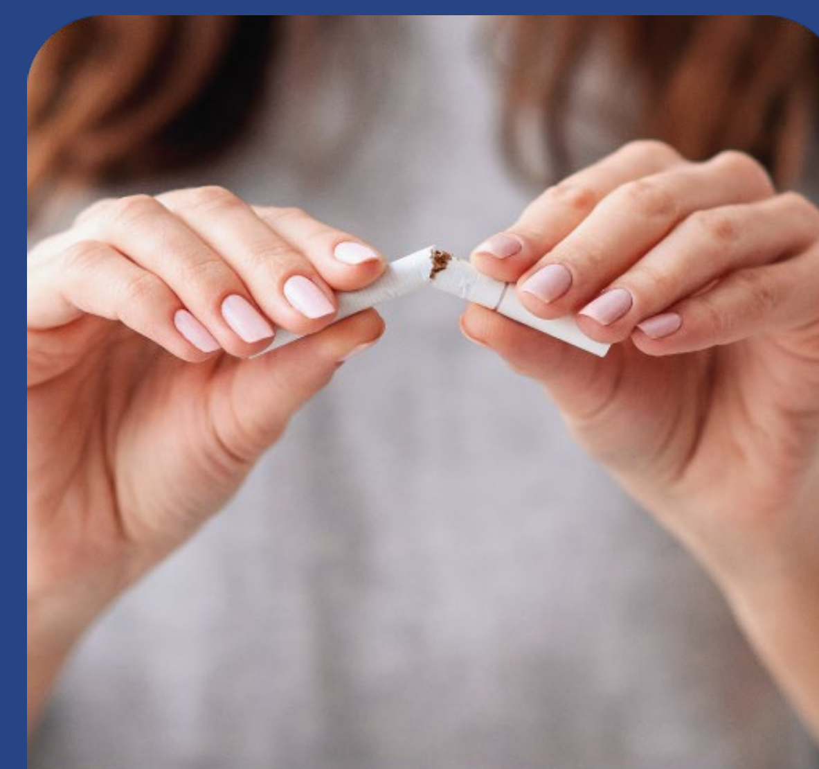
Tobacco Control Interventions