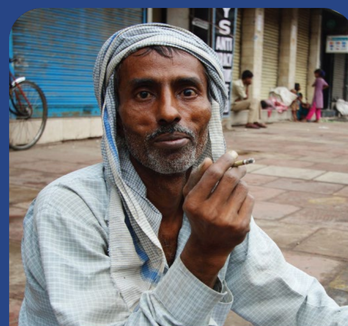
Fundamentals of Tobacco Control