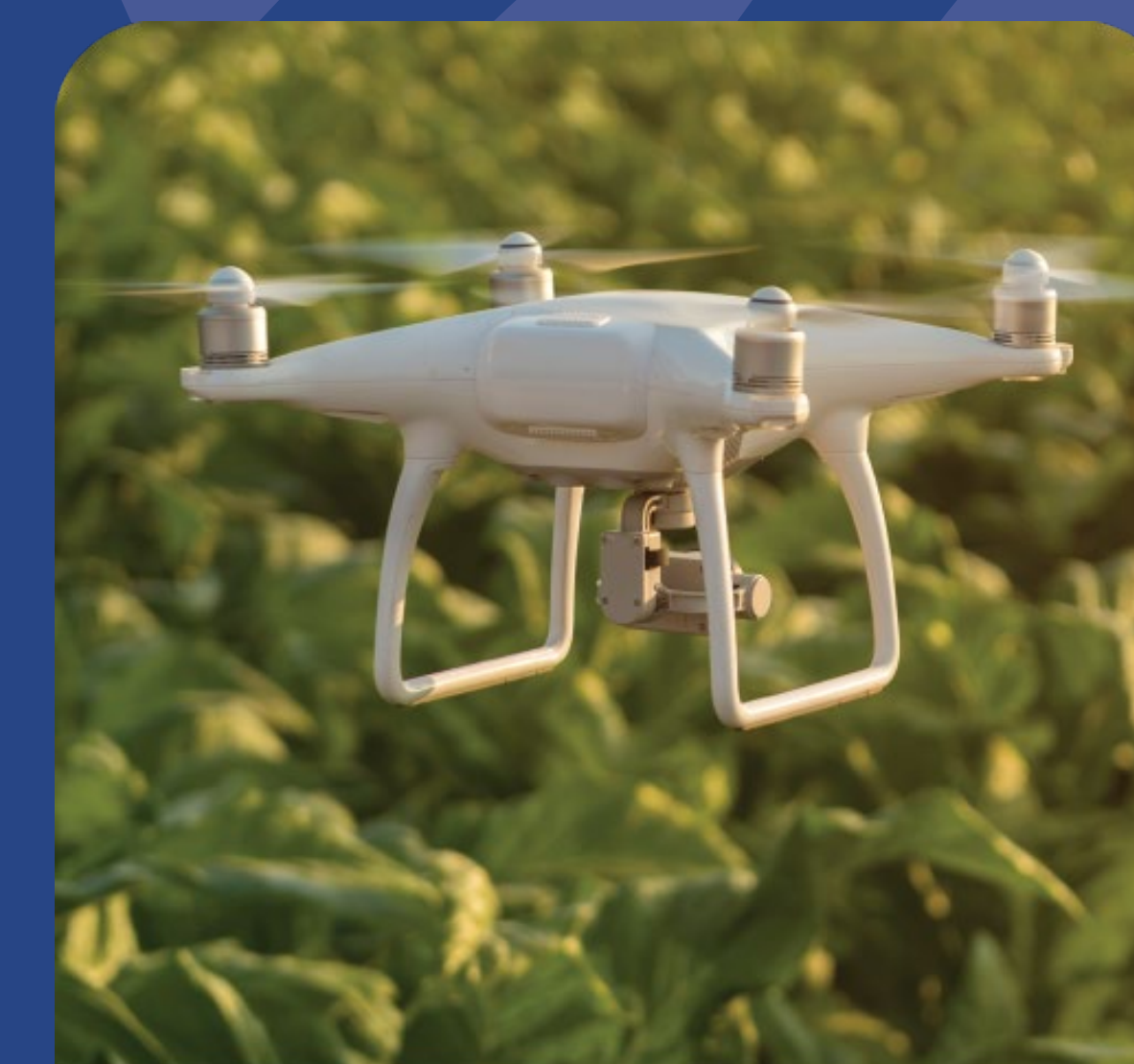
Surveillance and Evaluation