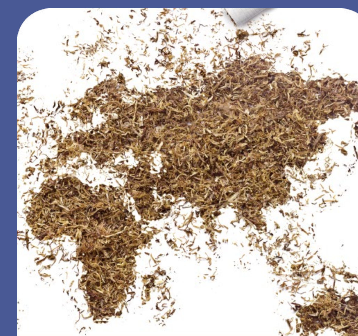
The Tobacco Industry