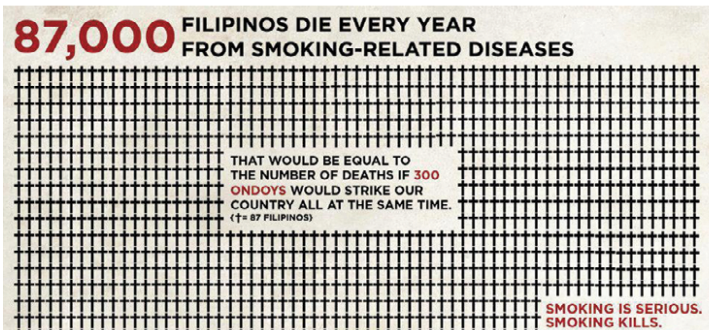
AER / BAWAL BISYO BILL CAMPAIGN

The tobacco-alcohol dynamic also affected key deliberations and voting in the Ways and Means Committee in the House of Representatives. According to committee members and their staffs, the discussion around the tax reform was vigorous. Ultimately, a core group of supporters for a