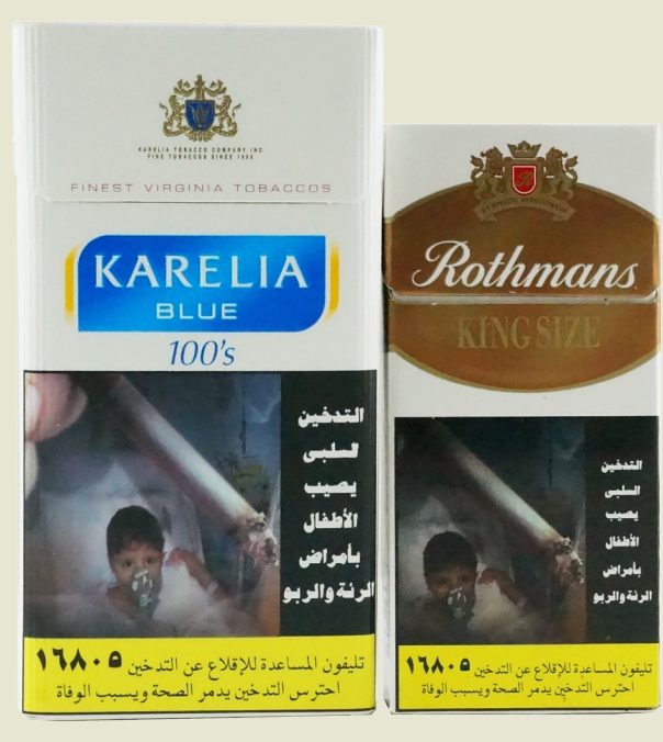
HWL with proper contrast and correct crop