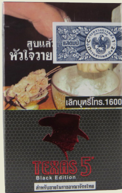
Back of pack

These packs are compliant with the four key HWL requirements. However, the tax stamp position partially covers the HWL. On hard packs, the tax stamp covers the rear HWL. On soft packs, the HWL covers part of the front and rear HWL.