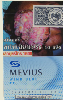
Back of pack