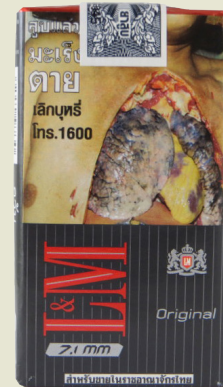
Back of pack