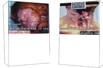
Front of pack Back of pack

Thailand's HWL size ranked 2nd in the WHO South East-Asia Region and ranked 14th globally in 2012. 1 Thailand meets FCTC guidelines for warning size on the front and back of the pack.