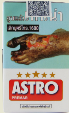
Front of pack