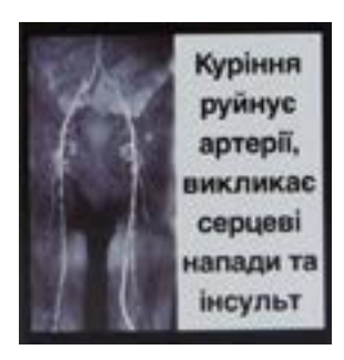
Ukraine Text: Smoking clogs the arteries and causes heart attacks and strokes