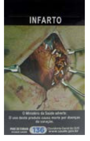
Brazil Text: HEART ATTACK - The use of this product causes death from heart disease