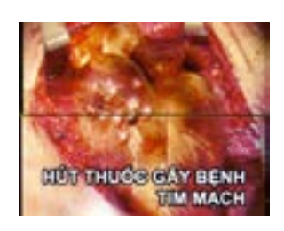
Vietnam Text: Smoking causes cardiovascular disease